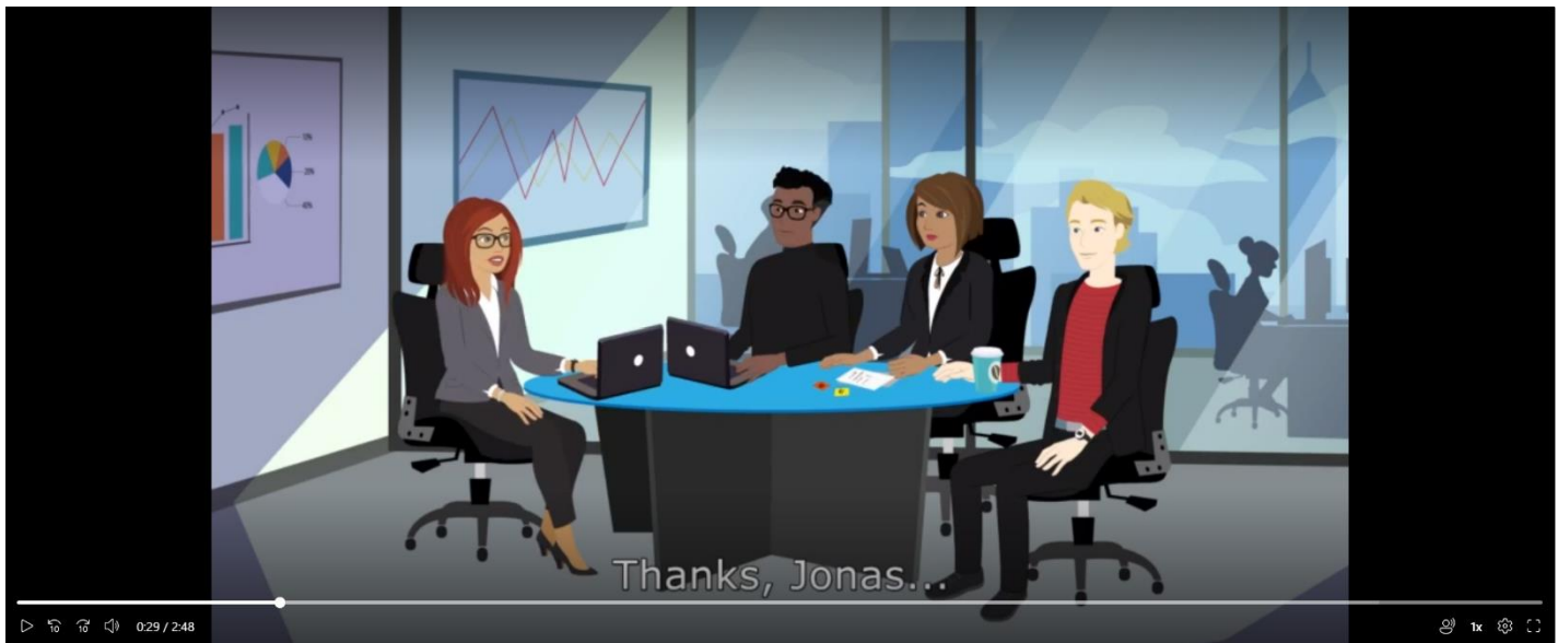
Example of an Animation Video on the Exam

Enhanced Matching: For most enhanced matching (drag and drop) items, candidates will see two columns of boxes. They will be given a scenario and will need to match the boxes on the left with the boxes on the right (opposite for Arabic candidates). They will simply click and drag one of the boxes on the left-hand side and place it on the appropriate box on the right-hand side. They will do this for all the boxes in the left-hand column.