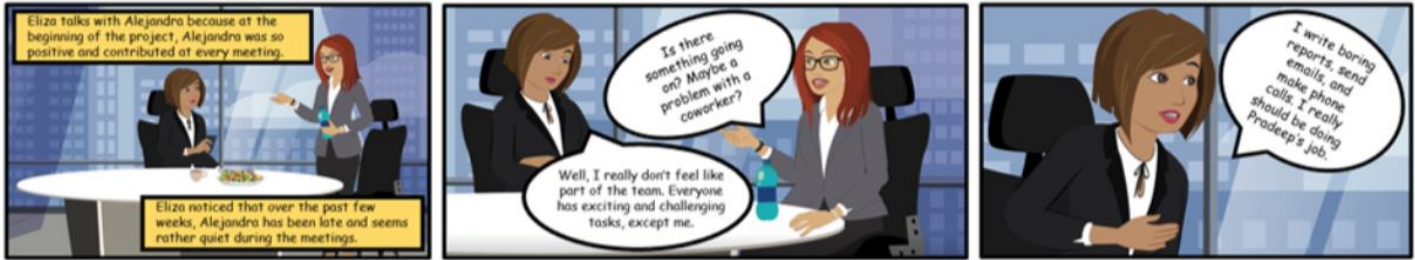
Example of a Comic Strip on the Exam

Animation video: For animation video items, candidates will watch the animation video. Candidates can watch the animation multiple times and use the video controls to start, stop, rewind, etc. Based on the scenario, the candidate will be presented with a multiple-choice question to answer. Candidates will receive headphones at the testing center. The animations will have audio and will also include closed captioning.